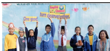
One good turn deserves another.