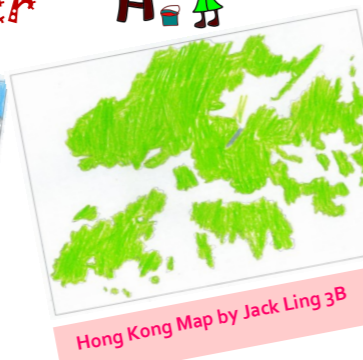
Hong Kong Map by Jack Ling 3B