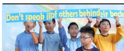
Don't speak ill of others behind their backs.