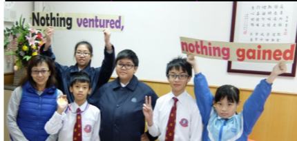
Nothing ventured, nothing gained.