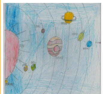
Our Solar System