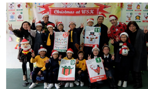
The Christmas Mini Show with some Elite Helpers!