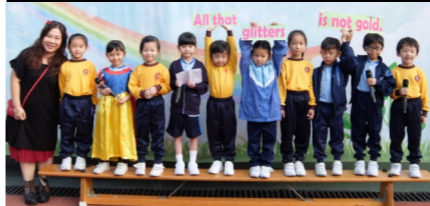
All that glitters is not gold.