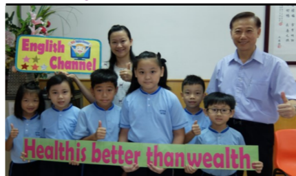
Health is better than wealth.