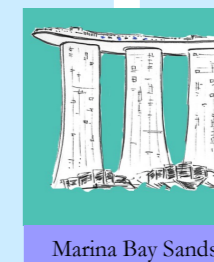
Marina Bay Sands