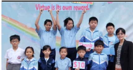
Virtue is it's own reward.