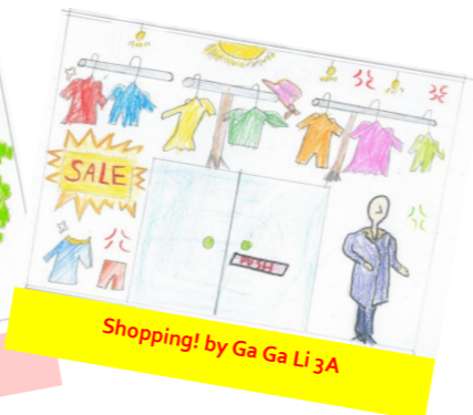
Shopping! by Ga Ga Li 3A