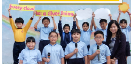
Every cloud has a silver lining.