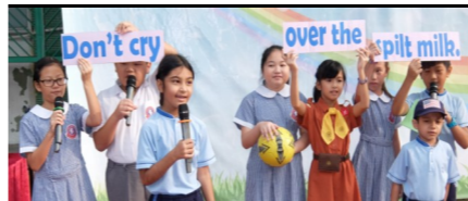
Don't cry over the spilt milk.