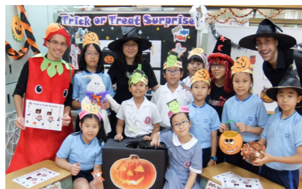
Halloween fun with some Elite Helpers!